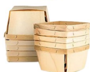
Berry Boxes & Clementine Boxes (wooden)